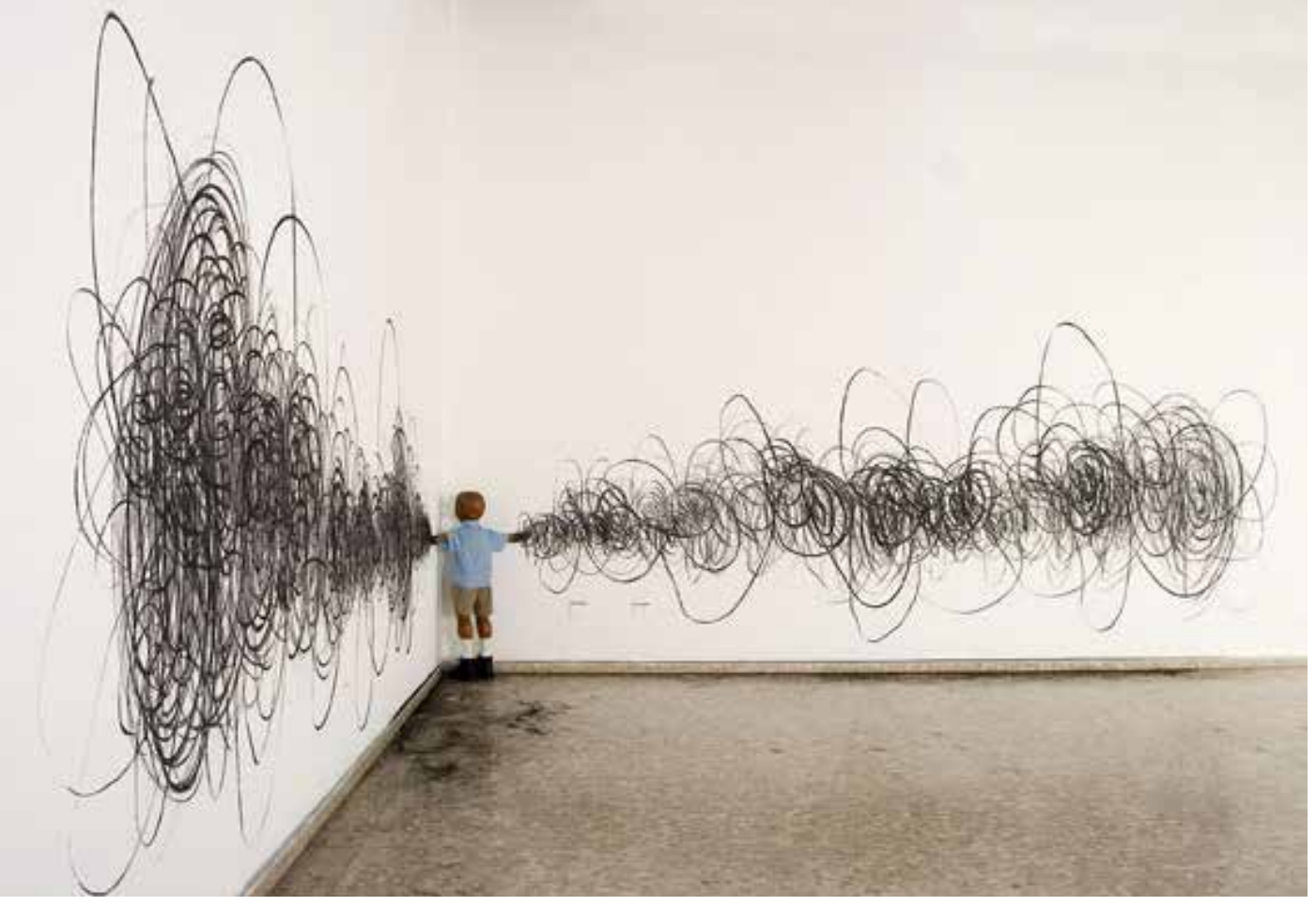
Figure 5. Jorge Pineda, Me voy, Sur , 2006. Life-sized child figure; wall drawing.

body, turned against the wall; the top is burned, the place from which, again, many black scribbles are emerging to cover the wall. Lastly, the installation El bosque ( The Woods ; 2004) features a little girl in a skirt and a hooded sweater with her face to the wall; this time it appears that her face has been burned, since this is where the black scribbles seem to originate from. All these pieces suggest that these children have been cruelly punished for coloring on the wall; yet, at the same time their crippling injuries are the very sources of their childlike expressions of creativity. They are, in their shame, turned toward the wall and away from the world. These installations thus evoke a complex indictment of Western conceptions of the child—the other of the self-possessed Western subject—that inextricably welds the notion of the child to grave forms of wounding. Though Pineda's critical take on the figure of the child may not readily appear associated with any particular location, his work at least obliquely gestures toward the logics