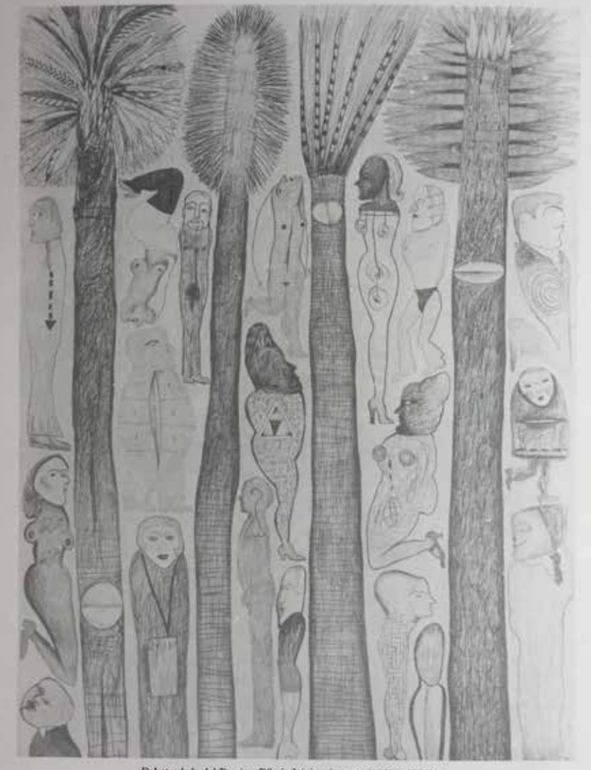
Del otro lado del Paraiso. Dibujo Lápiz sobre papel 120 x 150 Cms.