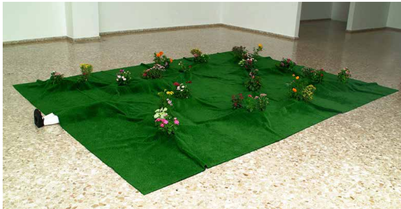
Figure 4. Jorge Pineda, El sueño de Winnie de Pooh, 2001. Plastic lawn with flowers; partially covered child figure. Courtesy of the artist

Pineda's figural installations of lifelike children and youth provoke a strong sense of terror and deep unease by creating scenes that tell us something terrible must have taken place. One of his most famous installations, El sueño de Winnie de Pooh (Winnie de Pooh's Dream ; 2001) is notably featured on the cover of Jarne's Arte contemporáneo dominicano . This work features a fake grass lawn with flowers, under which one can make out the silhouette of a little girl's body; her legs and feet, with white tights and black shoes, are sticking out from beneath the edge of the lawn (fig. 4). The quaint and homily garden scene, which appears carefully tended too, contrasts and ultimately masks a literally underlying crime: the little girl's burial beneath it. This powerfully evokes a terrible "underside"—the human cost—underlying the manicured